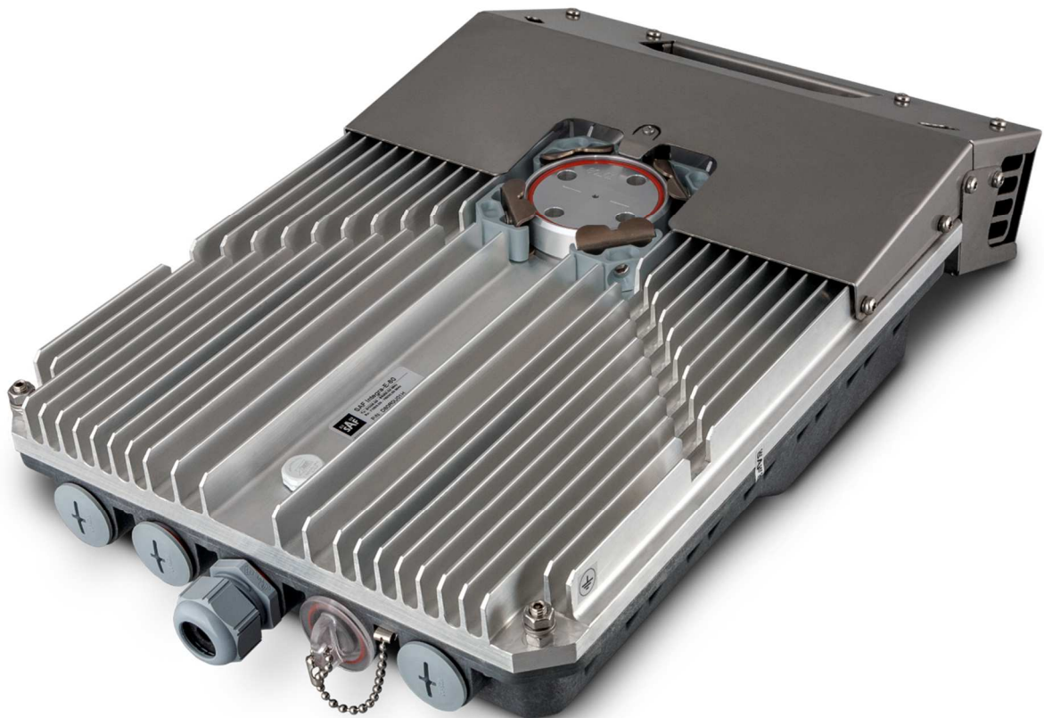
Pic 1. The exterior of Integra-E with antenna flange up

In most countries E-band radios are easy to deploy with no or minimal licensing requirements. Reducing time to deployment and reducing Total Cost of Ownership (TCO).