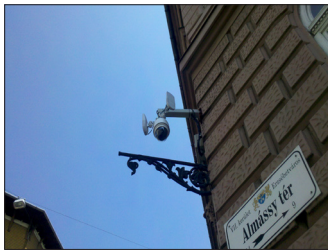
ePMP Modules Connect Cameras and Provide Bandwidth for the Next Camera in the Architecture

While the analog network had performed well, new technology was available to enhance performance. Image quality would be improved by installing High Definition (HD) IP based cameras across the network. New network encoders would be used to process the images, and an all-wireless network owned and operated by the city would replace costly leased lines that were connecting each of the 90 cameras.