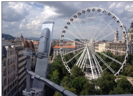
ePMP Access Point in Budapest City Center