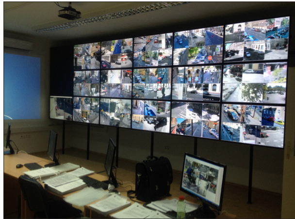
Video Surveillance Operations Center

This would provide a higher definition security system while saving the city the monthly costs of leased line infrastructure. VideoData was awarded the contract, with the requirement that the solution would have to be designed, installed and handed over to the city in 90 days.